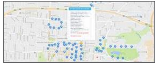
Over and Under-utilized APs