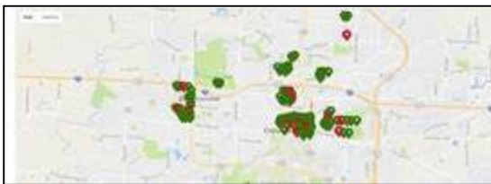
Access Point Inventory